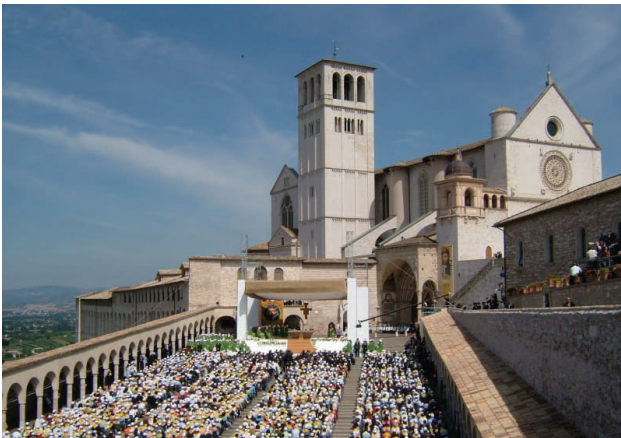
The Sacro Convento in Assisi, Italy

May the Lord give you His peace! In discerning a vocation to religious life, a young person may think that once he makes a decision, then his discernment is done and he then knows what path he is taking in life. Well it may be true that he has made a decision, but where the path may lead might be full of surprises. As men who live out a vocation to holiness in Gospel fraternity, we continue to grow in our personal as well as communal relationships with the Lord. At one point in our respective lives, we chose this vocation. Throughout our